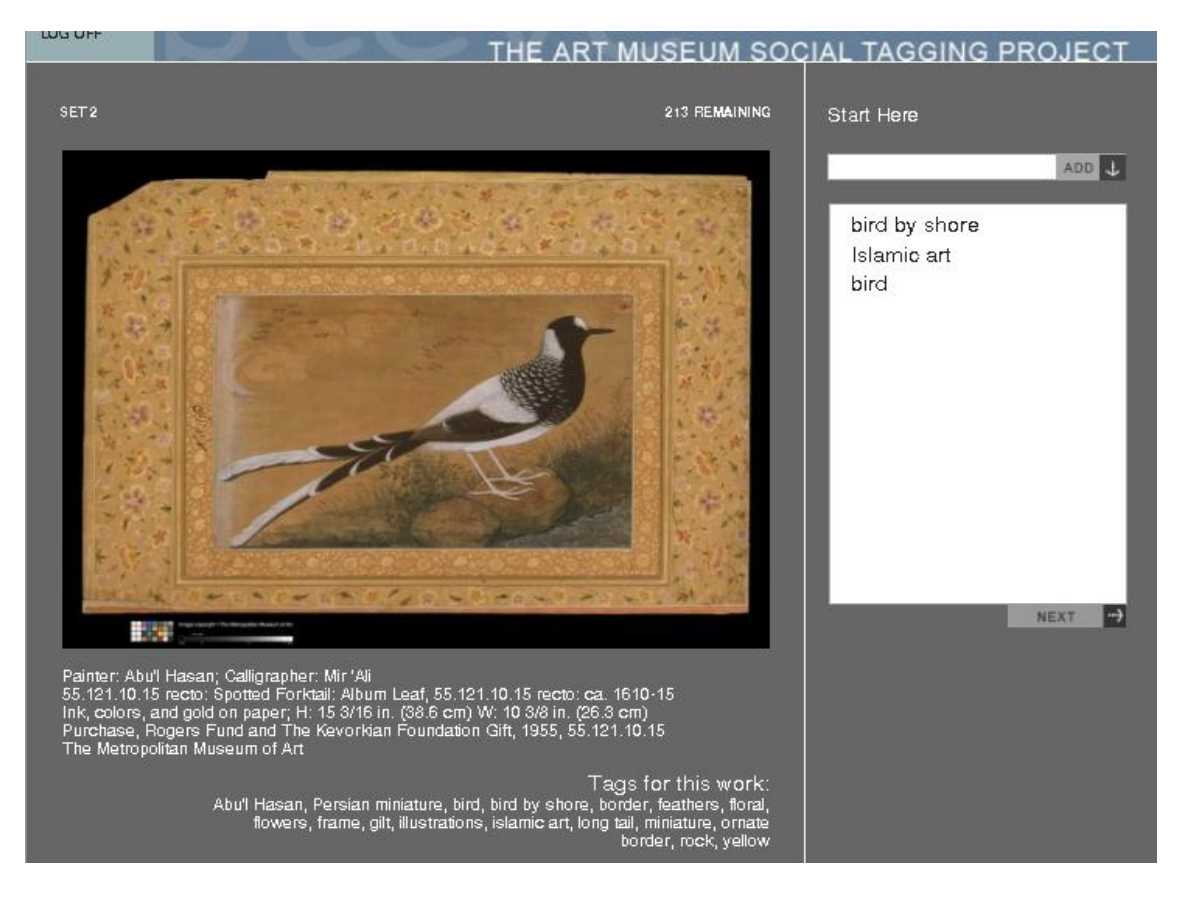
Figure 3: steve.museum tagger interface<sup>9</sup> retrieved from steve.museum on 22.8.09

There are basically 2 forms for tagging systems: ones that show no previous tags and ones that provide the tagger with information about the artifact to be tagged, including the formal documentation and/or previous tags. Figure 3 shows the interface of the tagging system developed by the steve.museum project in which 3 tags have been defined. This system provides both museum documentation and previous user tags assigned to the image and accepts multiple-term tags. The system also accepts multiple entries of the same tag (both bird and Islamic art had been entered earlier). In this example, the museum annotation contains 2 semantic terms – spotted forktail , while the current tags have added an additional 21 semantic descriptors.