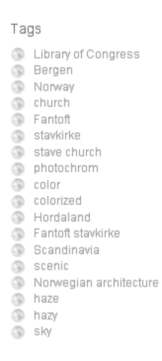
Figure 2: Image tags retrieved from Flickr.com for the Image of Fantoft stave church In Fig.1.a

The term Folksonomy was coined by Thomas Vander Wal in 2004<sup>5</sup> as a combination of the terms folk (public) and taxonomy (word list), At a fundamental level, a folksonomy is a collection of terms, called tags , created by multiple viewers of Internet artifacts with the intent of being able to find these artifacts again. The process is called social tagging . A single tag describes some aspect of an artifact which can be any item of interest, such as a web-page, a song, image or text document. Each unique term in a folksonomy references the set of artifacts that have been tagged with this term. An example of a set of tags for the image shown in Figure 1a is shown in figure 2<sup>6</sup>.