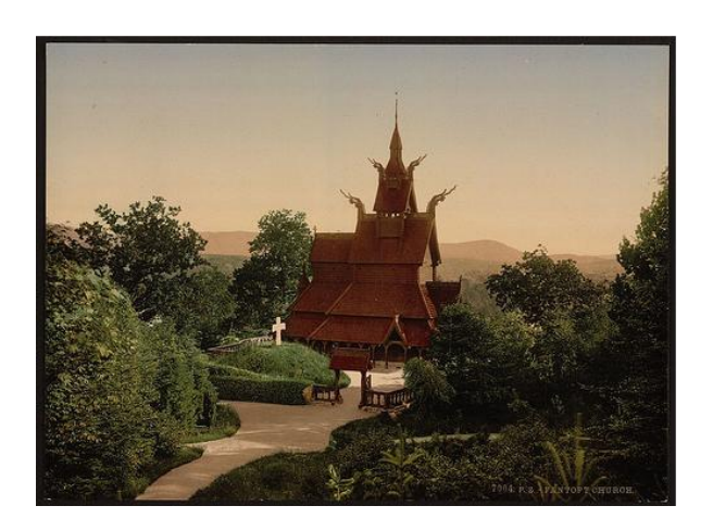
Figure 1a: image retrieved from LoC/Flicker<sup>2</sup> on 9.7.09

Museums invest substantial sums in annotating and cataloging their artifacts so that they are retrievable. Both libraries and museums have developed standardized forms for description of their artifacts. A simplified description of an image of Bergen's Fantoft stave church, shown in Figure 1a, is shown in Figure 1b, retrieved from the image collection of the US Library of Congress on The Commons on Flickr<sup>1</sup>.